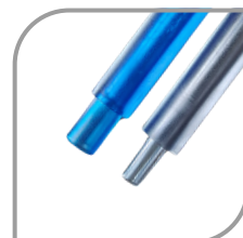
Male and Female luer connector